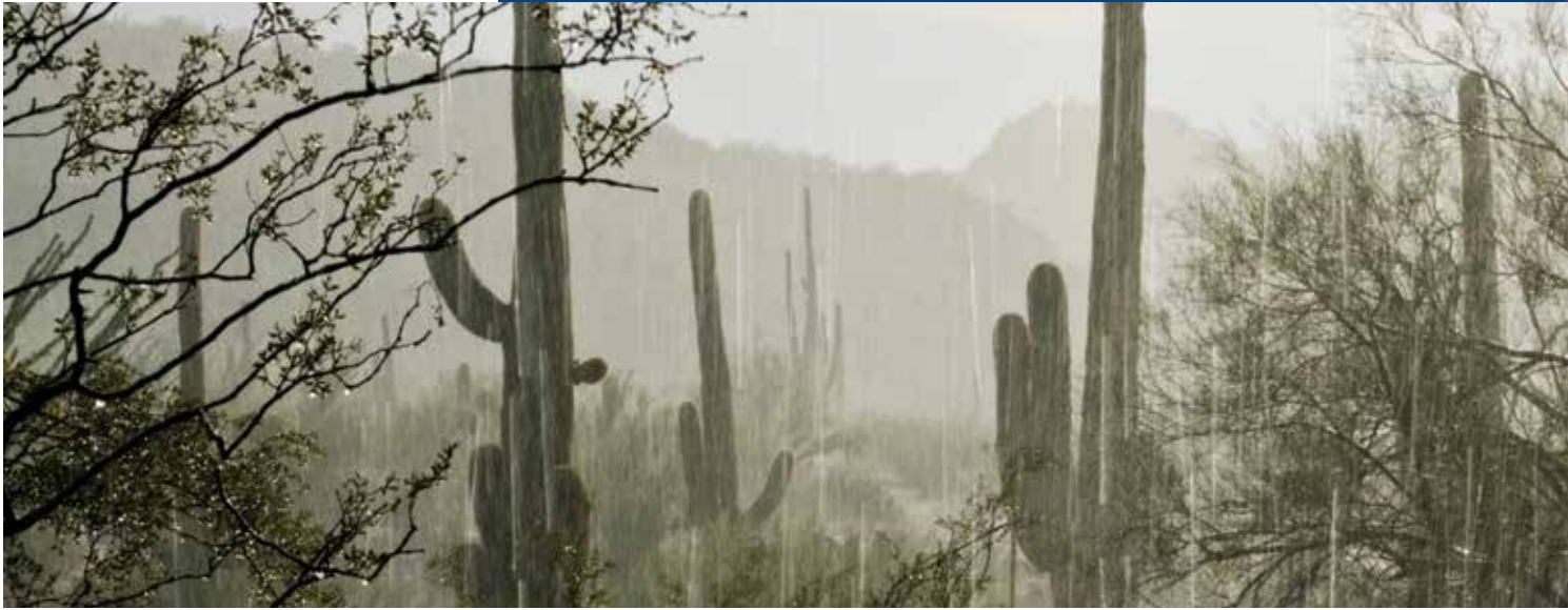
RANDALL D. BABB

The desert, parched dry from the incredibly hot summer, is in desperate need of water. With little or no rain for several months, plants and wildlife are reacting to the shortage of available water sources. Each year, the monsoons begin to build in early July. Suddenly, massive clouds soar over the desert. With incredible fury, Mother Nature delivers an astonishing amount of water in a very short period of time.